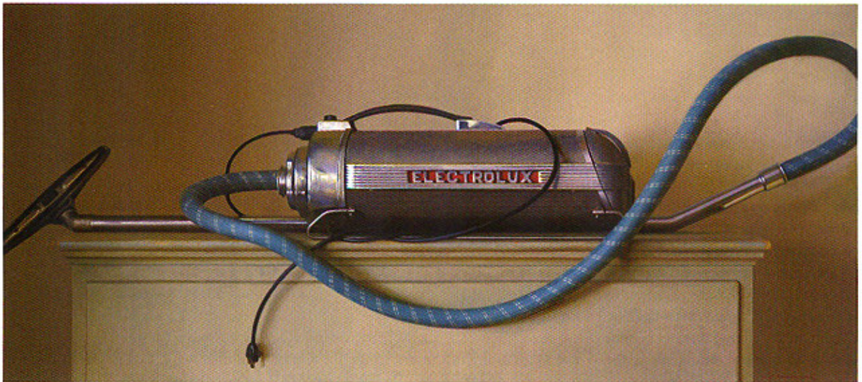
ELECTROLUX, OIL ON CANVAS, 26 X 52"