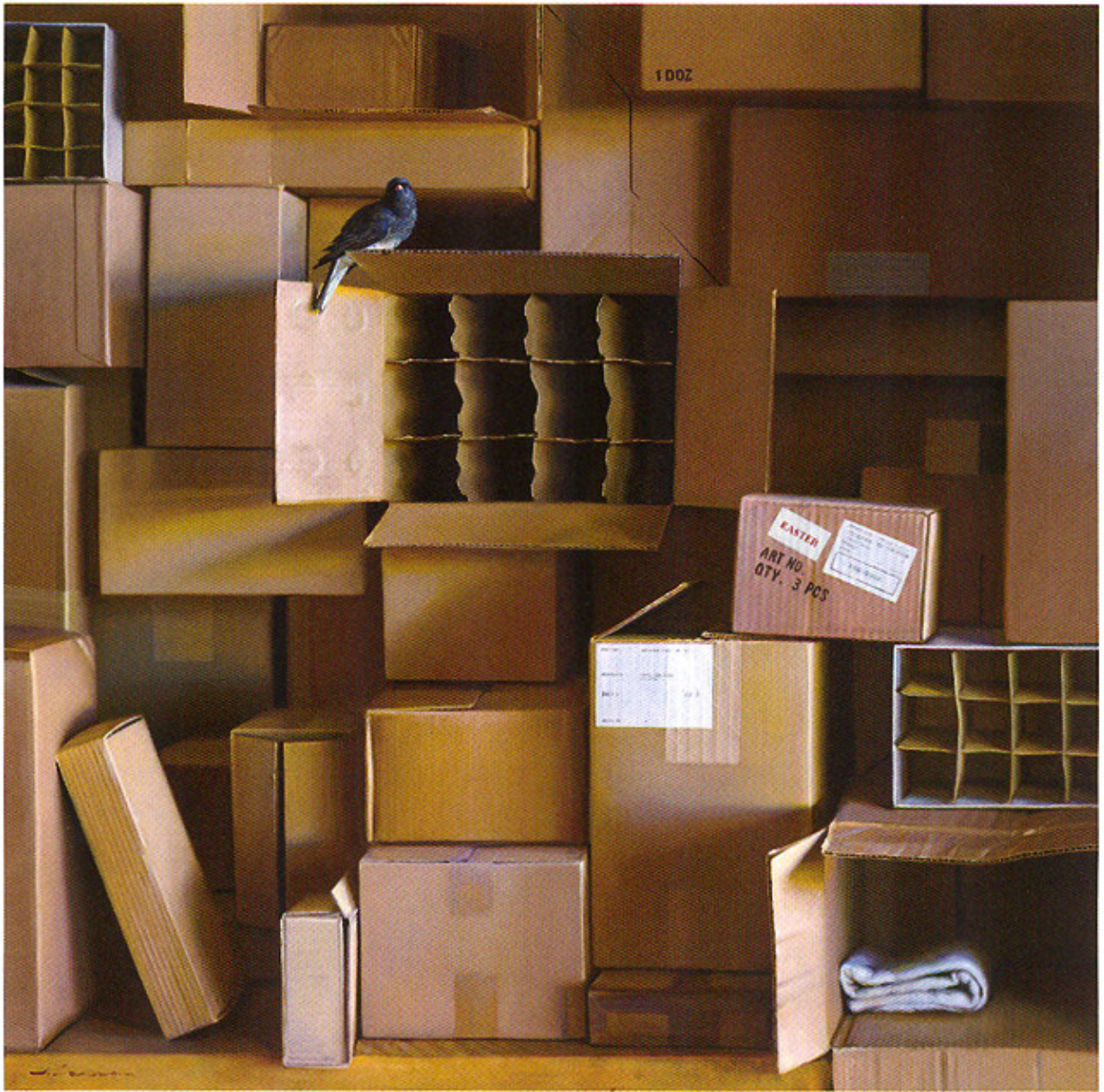
OPEN BOX, OIL ON CANVAS, 46 X 46"